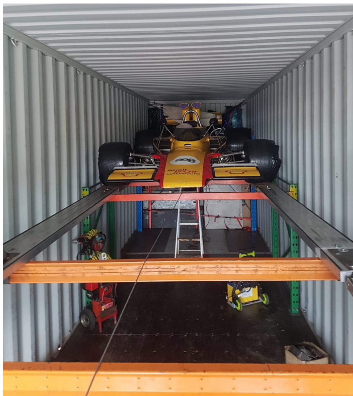
Australian category colleague Peter Brennan's ex-Lella Lombardi Lola T330 loaded into its specially converted shipping container ready for pick up (shown here in Melbourne) then eventual return after a sojourn in the USA, courtesy long-time NZ series sponsor and supporter, the MSC shipping line.