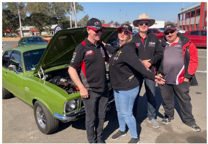
▲ It's a happy Holden outing for this group of rusted-on Red Lion fans celebrating the Shannons Show and Shine medal awarded to this green LJ GTR XU-1.