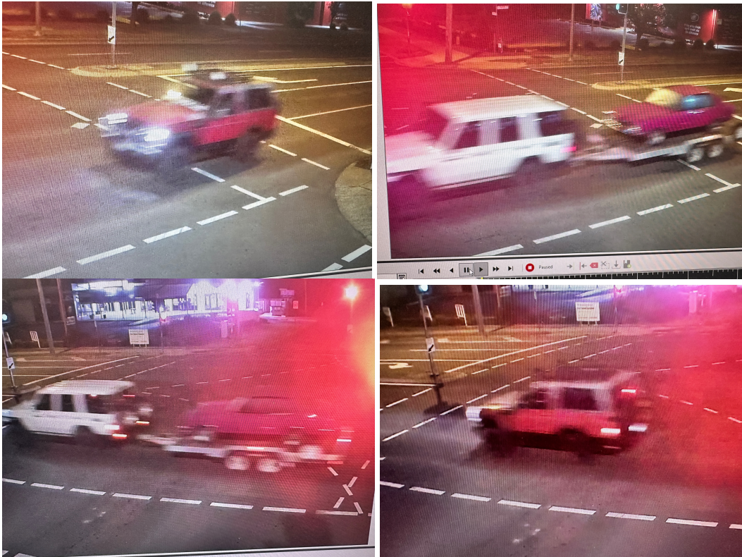
THREE SUSPECT VEHICLES