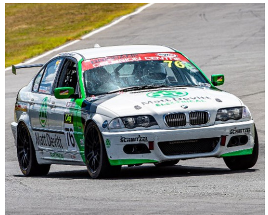
Josie gets instruction from dad at Turn 7