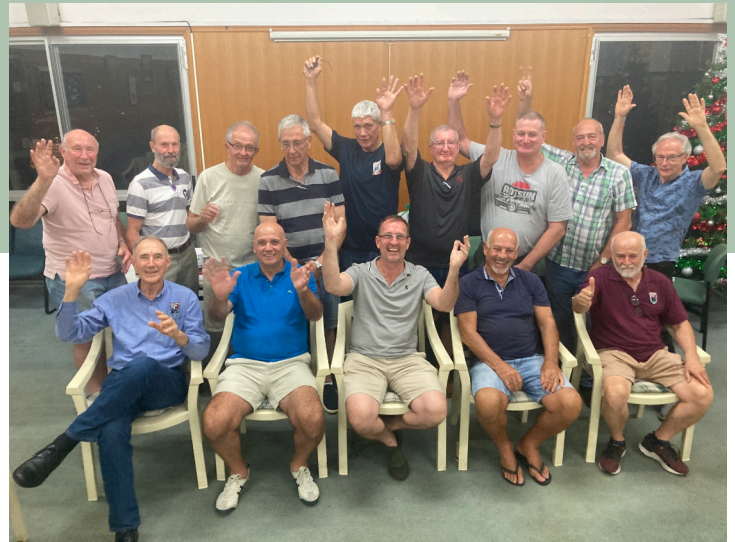
Celebrating a successful 2023 Cheers!