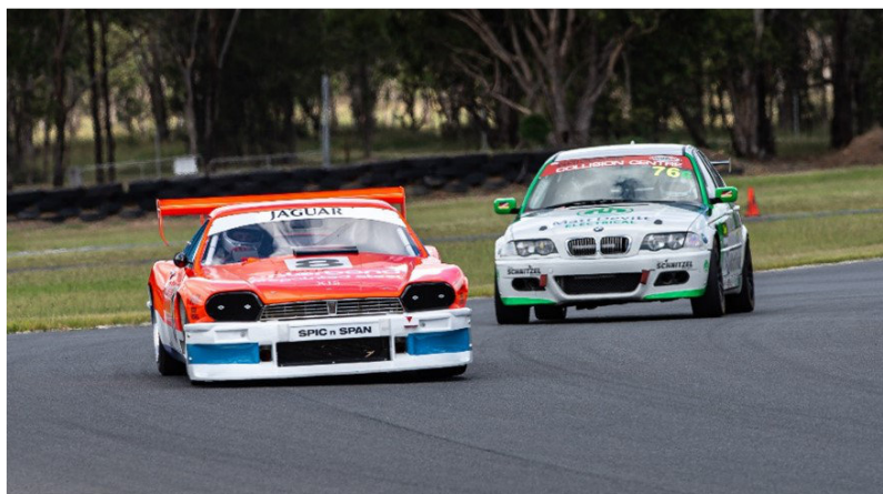
▲No stress, Josie keeps clear of the fastest car at the event.