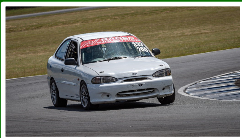
▲Erica finding a good line through Turn 7.